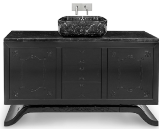
Metropolitan Vanity Cabinet

As part of this ongoing collaboration between brands, KOKET selected some of its favorite Maison Valentina designs, which they will offer as part of KOKET's first-ever bathroom focused collection.