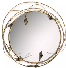
Stella | Mirror

In addition to KOKET offering Maison Valentina, Maison Valentina will also offer a curated selection of KOKET designs perfectly suited for use in bathroom design.