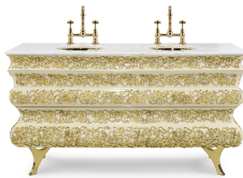
Crochet Vanity Cabinet