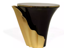
Yasmine Polished Brass | Side Table