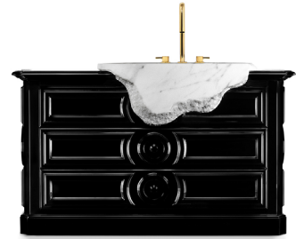
Petra Vanity Cabinet

In addition to KOKET offering Maison Valentina, Maison Valentina will also offer a curated selection of KOKET designs perfectly suited for use in bathroom design.