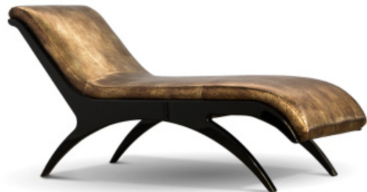
ZEBRA | CHAISE

The soft lines and curves of the Mia chair give her the gentle yet mesmerizing radiance of a precious newborn or delicately blooming flower.