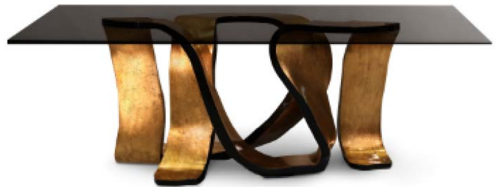
RIBBON | DINING TABLE

Three elegant Victorian cast brass hands on a delicate tripod base hold iridescent peacock feather top.