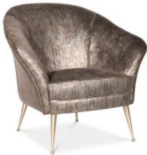
CHICLET | CHAIR

The classic KOKET solid brass "three leg" chair supports a classic Asian inspired back with a loose pillow cushion.