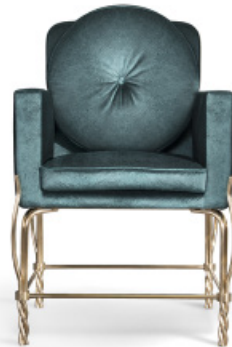
HEMMA | CHAIR

This easy chair shows it's vintage lines starting with delicate metal tapered legs supporting a perfectly wrapped arm and frame.