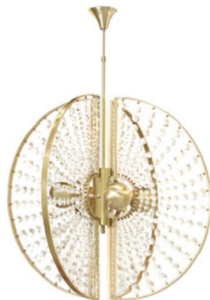
ROXY | CHANDELIER

Get wrapped up in the rhythmic design of the Ribbon dining table.