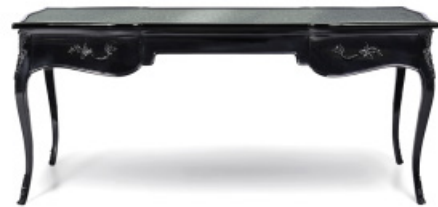
ORMOLU | DESK

The geometric design and exotic finishes of the Opium cabinet will seduce you into a euphoric haze.