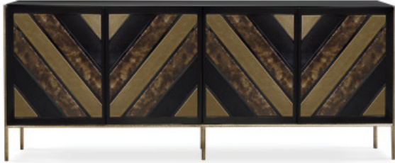
OPIUM | CABINET

The geometric design and exotic finishes of the Opium cabinet will seduce you into a euphoric haze.