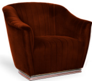
MIA | CHAIR

Hollywood Regency is brought to life with this fabulous dining or desk chair.