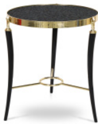
GISELE | SIDE TABLE

Classic design meets exotic opulence. French cabriole legs and exquisite metal ormolu support an exuberant peacock feather surface.