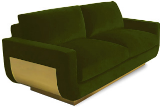
SOFIA | SOFA

Mid-century modern design has never looked so posh as the Sofia sofa.