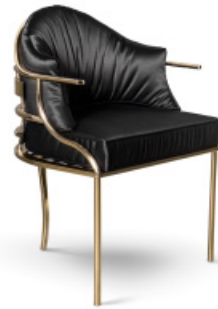
ASIA | CHAIR

Mid-century modern design has never looked so posh as the Sofia sofa.